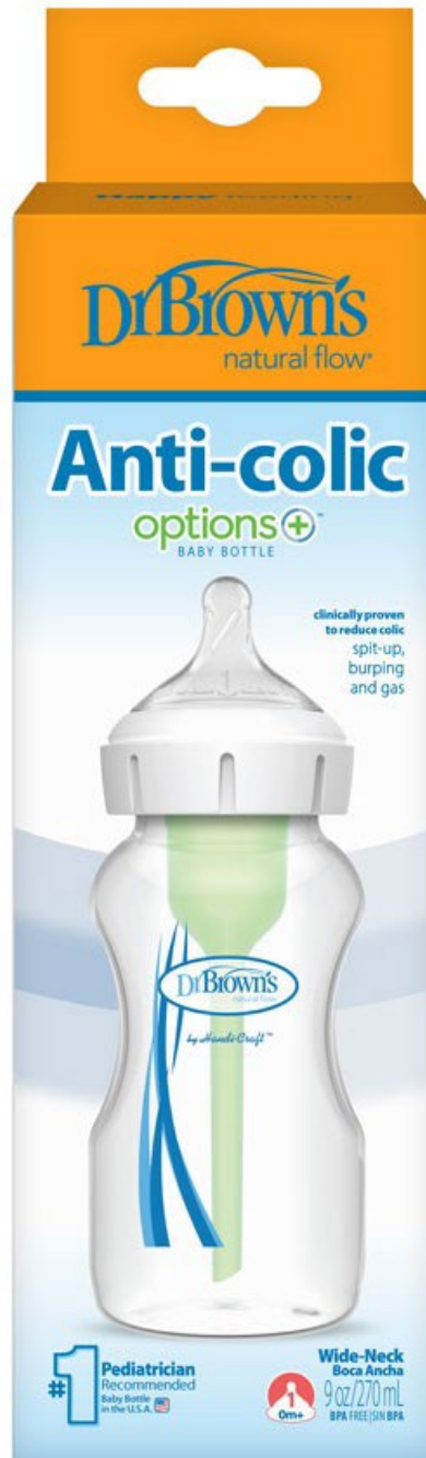
Exhibit 1-2: Dr. Brown's Natural Flow® Anti-Colic Options+™ Wide-Neck Baby Bottle