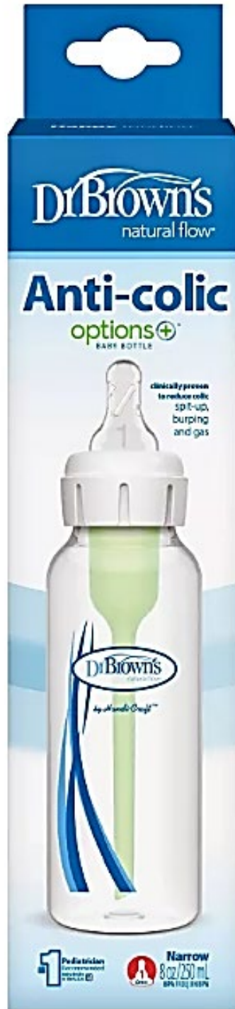
Exhibit 1-1: Dr. Brown's Natural Flow® Anti-Colic Options+™ Narrow Baby Bottle

Dr. Brown's Natural Flow® Anti-Colic Options+™ Narrow Baby Bottle: Product Image-Front (see https://www.drbrownsbaby.com/product/dr-browns-natural-flow-anti-colic-options-plus-narrow-baby-bottle-with-level-1-slow-flow-nipple/ (downloaded 6/24/2024))