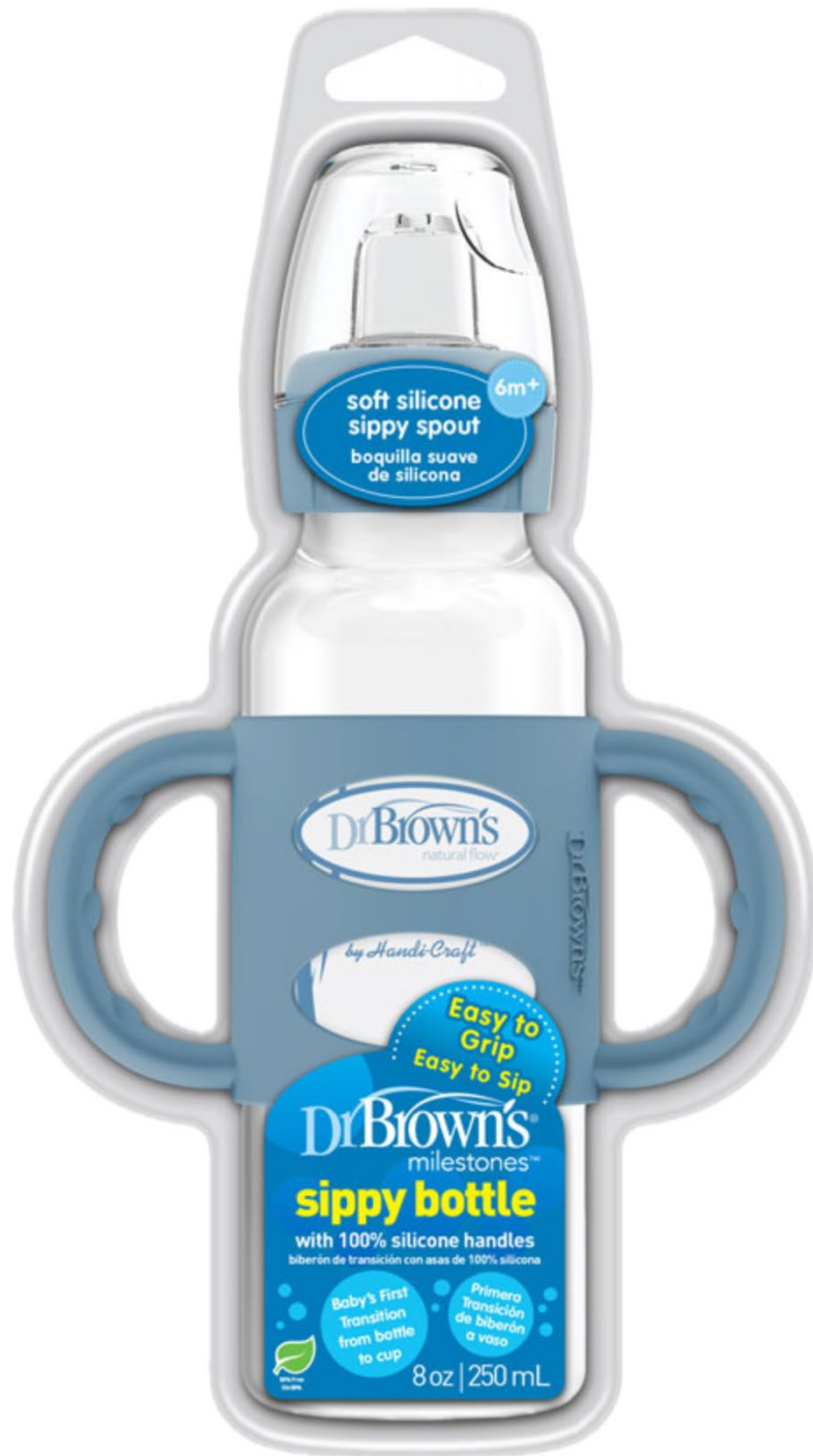
Exhibit 1-5: Dr. Brown's Milestones™ Narrow Sippy Bottle

Dr. Brown's Milestones™ Narrow Sippy Bottle: Product Image-Front ( see https://www.drbrownsbaby.com/product/milestones-narrow-sippy-bottle-handles/ (downloaded 6/24/204))