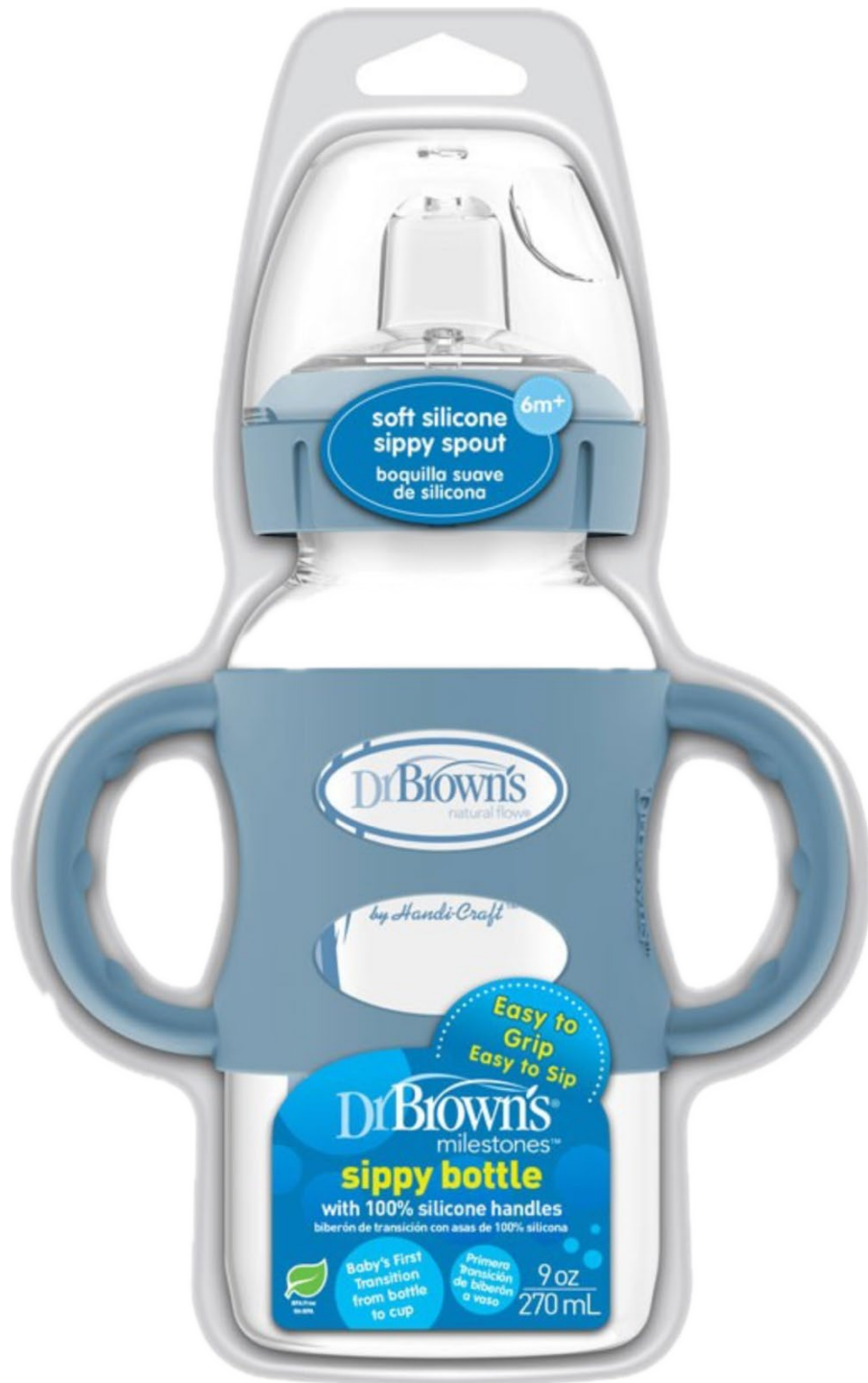
Exhibit 1-6: Dr. Brown's Milestones™ Wide-Neck Sippy Bottle

Dr. Brown's Milestones™ Wide-Neck Sippy Bottle: Product Image-Front ( see https://www.drbrownsbaby.com/product/milestones-wide-neck-sippy-bottle-handles/ (downloaded 6/24/204))