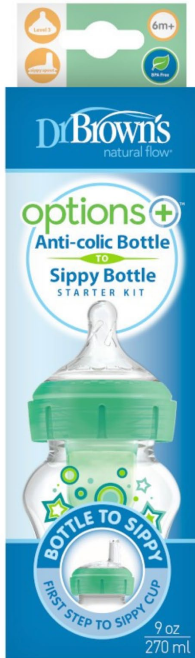
Exhibit 1-8: Dr. Brown's Natural Flow® Anti-Colic Options+™ Wide-Neck Sippy Bottle Starter Kit

Dr. Brown's Natural Flow® Anti-Colic Options+™ Wide-Neck Sippy Bottle Starter Kit: Product Image-Front (see https://www.drbrownsbaby.com/product/dr-browns-options-wide-neck-sippy-bottle-starter-kit/ (downloaded 6/24/204))