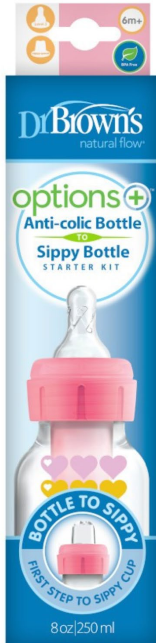
Exhibit 1-9: Dr. Brown's Natural Flow® Anti-Colic Options+™ Narrow Sippy Bottle Starter Kit

Dr. Brown's Natural Flow® Anti-Colic Options+™ Narrow Sippy Bottle Starter Kit: Product Image-Front (see https://www.drbrownsbaby.com/product/dr-browns-options-baby-bottle-and-sippy-spout-sippy-bottle-starter-kit-8-ounce-rainbow-blue/ (downloaded 6/24/204))