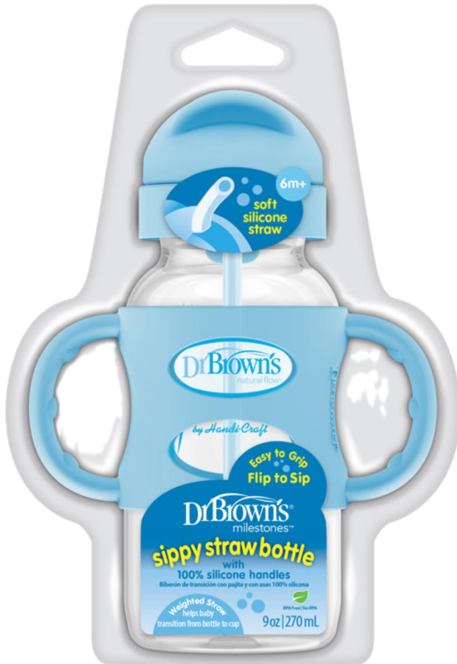
Exhibit 1-4: Dr. Brown's Milestones™ Wide-Neck Sippy Straw Bottle

Dr. Brown's Milestones™ Wide-Neck Sippy Straw Bottle: Product Image-Front (see https://www.drbrownsbaby.com/product/milestones-wide-neck-sippy-straw-bottle-with-silicone-handles/ (downloaded 6/24/2024))