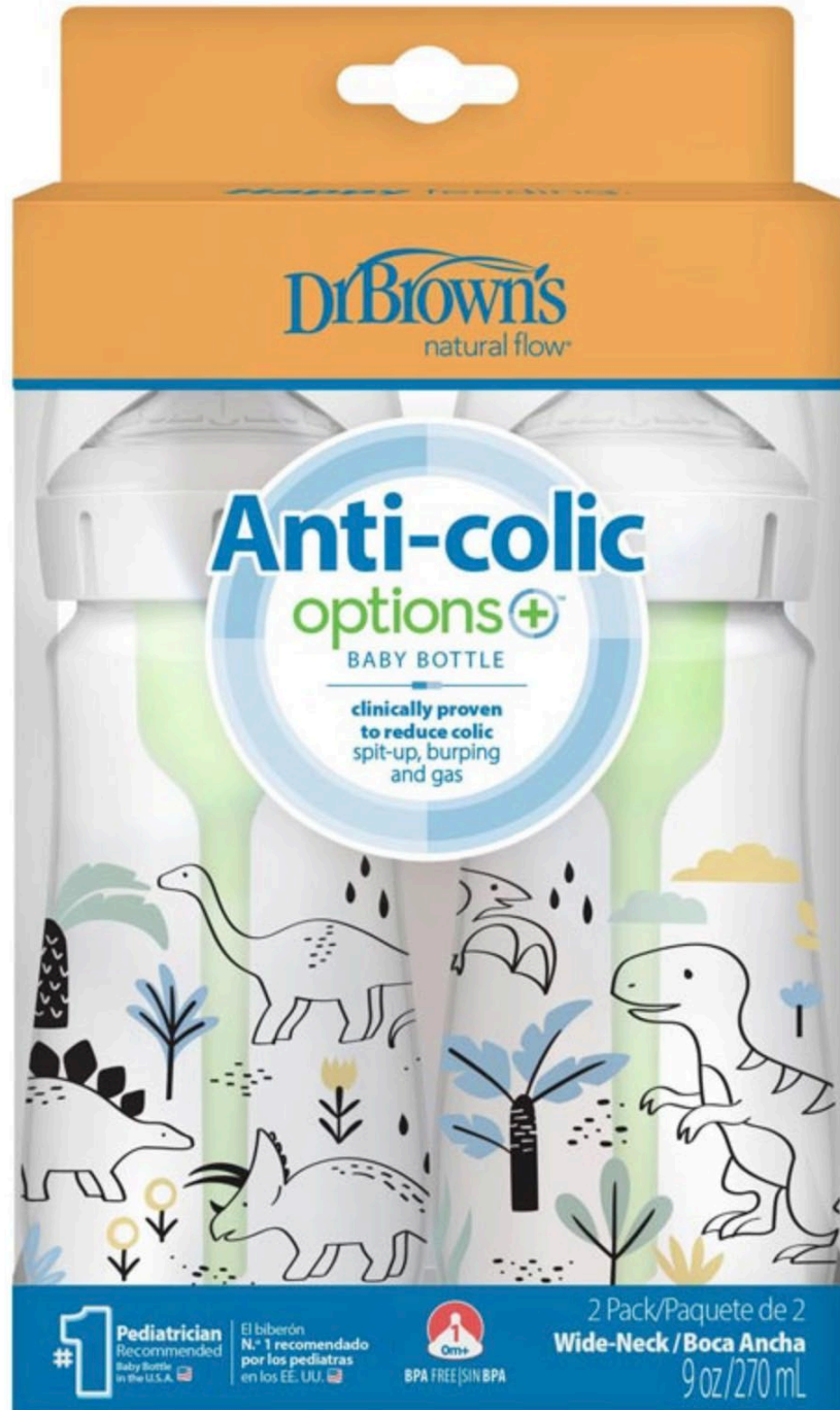
Exhibit 1-12: Dr. Brown's Natural Flow® Anti-Colic Options+™ Wide-Neck Baby Bottle

Dr. Brown's Natural Flow® Anti-Colic Options+™ Wide-Neck Baby Bottle: Product Image-Front (see https://www.drbrownsbaby.com/product/natural-flow-options-wide-neck-bottles-9oz-270ml/ (downloaded 6/24/204))