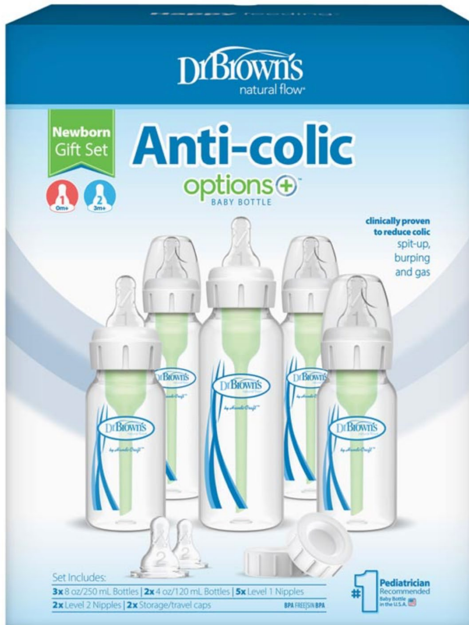
Exhibit 1-7: Dr. Brown's Natural Flow® Anti-Colic Options+™ Narrow Baby Bottle Newborn Gift Set