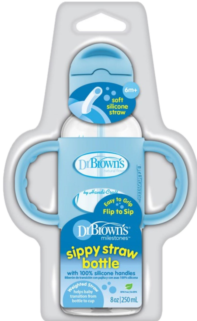
Exhibit 1-3: Dr. Brown's Milestones™ Narrow Sippy Straw Bottle

Dr. Brown's Milestones™ Narrow Sippy Straw Bottle: Product Image-Front (see https://www.drbrownsbaby.com/product/dr-browns-milestones-sippy-straw-bottle/ (downloaded 6/24/2024))