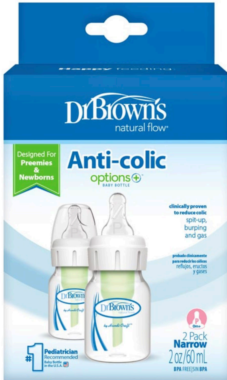
Exhibit 1-10: Dr. Brown's Natural Flow® Anti-Colic Narrow Baby Bottle, 2oz/60mL with Premie Flow™ Nipple

Dr. Brown's Natural Flow® Anti-Colic Narrow Baby Bottle, 2oz/60mL with Premie Flow™ Nipple: Product Image-Front (see https://www.drbrownsbaby.com/product/dr-browns-options-narrow-preemie-baby-bottle/ (downloaded 6/24/204))