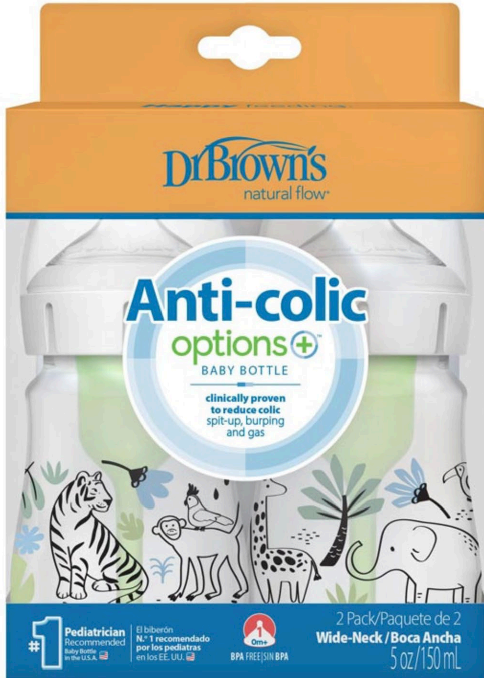
Exhibit 1-13: Dr. Brown's Natural Flow® Anti-Colic Options+™ Wide-Neck Baby Bottle

Dr. Brown's Natural Flow® Anti-Colic Options+™ Wide-Neck Baby Bottle: Product Image-Front (see https://www.drbrownsbaby.com/product/dr-browns-natural-flow-options-wide-neck-bottles-5oz-150ml/ (downloaded 6/24/204))